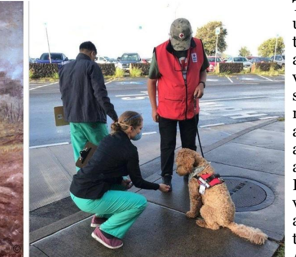
Throughout history up to the present, the Red Cross around the world has depended on 'man's best friend' to help soldiers and veterans.

Cross societies employed dogs that greatly aided the Allied forces during the war. A number of these dogs were attached to ambulance units and aided their handlers in the search for wounded soldiers. The Red Cross dogs were trained to seek out a wounded soldier and get as close as possible so the soldier could access the dogs' saddle bags, which contained first aid supplies and rations. Instead of barking and alerting the enemy, the dogs were trained to bring back something belonging to the soldier.