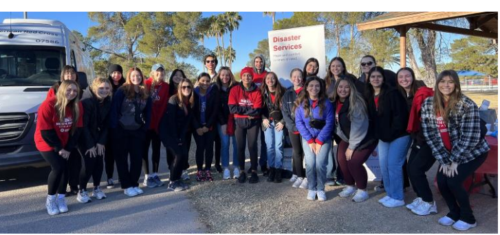
Nursing students from the University of Arizona College of Nursing participated in the Southern AZ Chapter's Sound the Alarm smoke alarm installation event.

On January 13, 2024, 550 lives and 161 homes were made safer in Tucson, AZ. The American Red Cross Southern AZ Chapter and their partners installed 652 smoke alarms that morning, and the University of Arizona, College of Nursing played a key role.