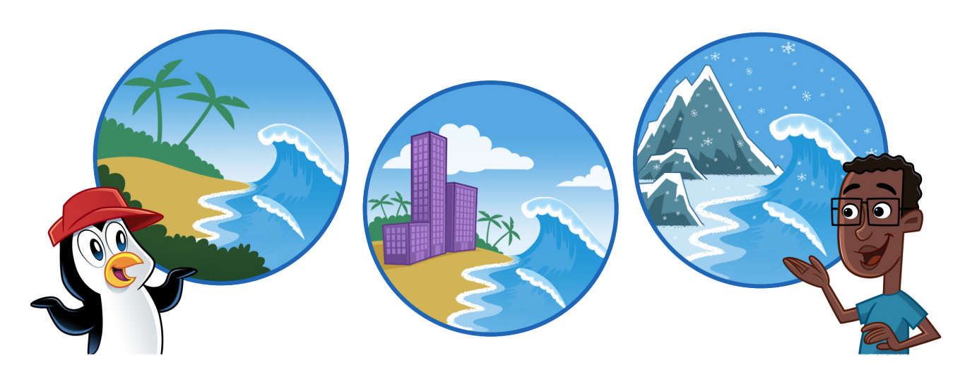
"Do they only happen on warm, sandy beaches like the ones here?" asked Pedro.

"A tsunami can happen if there's a landslide or earthquake under the ocean," added Ramona. "A tsunami can strike just a few minutes after an earthquake, or it can show up hours later if the earthquake happens far away."