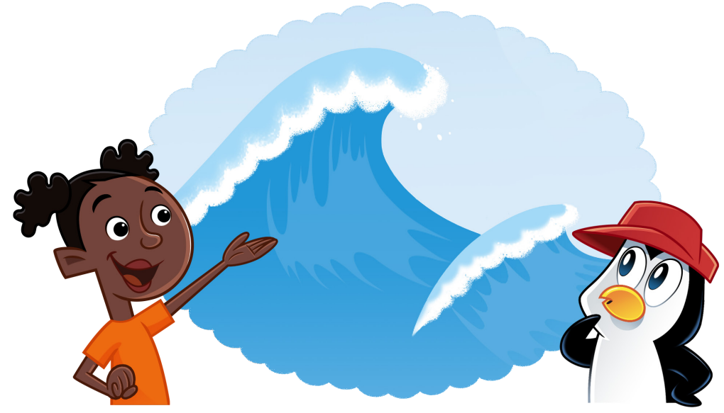
"A TSUNAMI is several huge waves that cause ocean water to come onto land," said Ramona.

"A tsunami can happen if there's a landslide or earthquake under the ocean," added Ramona. "A tsunami can strike just a few minutes after an earthquake, or it can show up hours later if the earthquake happens far away."