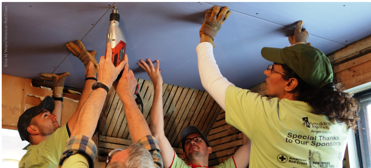
Red Crossers hang drywall at a Bergen County, N.J., home damaged by Superstorm Sandy, as part of Rebuilding Together's National Rebuilding Month.

A recovery effort of this scale is larger than any one organization, and the Red Cross has awarded grants totaling more than $91 million to dozens of nonprofits with specialized expertise and strong local ties. These grants have supported a network of skilled, community-based services that can best meet Sandy survivors' needs for food, housing, financial help, mental health support and guidance.